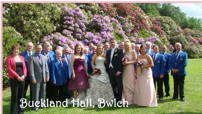
Buckland Hall, Bwlch