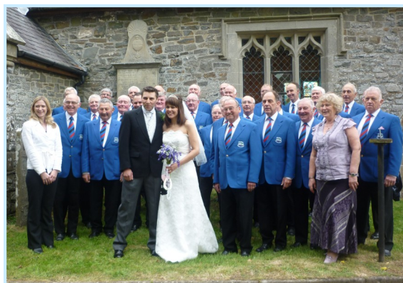
Members of the Choir with a happy bride and groom after their wedding

We have an extensive repertoire of music to sing before or during the service, and can augment the congregational singing of hymns. We can also sing during the signing of the register or provide a triumphal soundtrack to your procession up the aisle. We are happy to discuss repertoire and fee with the bride and groom and invite you to contact us ( details below )